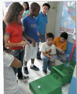
GOLFING IN SCOTLAND