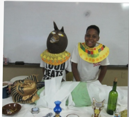
MAKING A MUMMY IN EGYPT