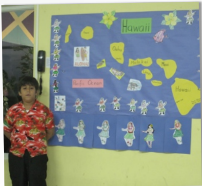
LEARNING ABOUT THE HAWAIIAN ISLANDS

On the days leading up to International Week it's all about information. Students must learn nearly everything about their countries plus they learn about each country they go to. But before they enter they must first get their passport stamped. International Day is all the fun of traveling minus the hassle.